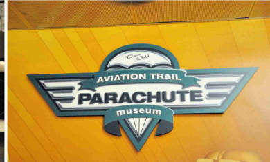
Above: Aviation Trail Visitor Center • Wright-Dunbar Interpretive Center • Dayton Aviation Heritage National Historical Park Corner of W. Third & S. Williams Sts., • 16 S. Williams St., Dayton, OH 45402 • (937) 225-7705