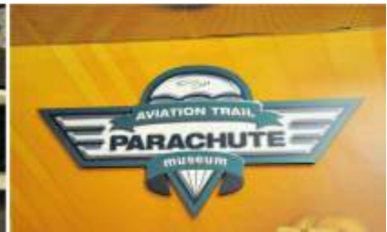
Above: Aviation Trail Visitor Center • Wright-Dunbar Interpretive Center • Dayton Aviation Heritage National Historical Park Corner of W. Third & S. Williams Sts., • 16 S. Williams St., Dayton, OH 45402 • (937) 225-7705