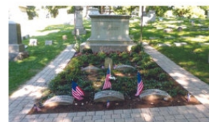
Wright Brothers Gravesite