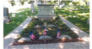
Wright Brothers Gravesite

January 12th @ 1:00pm Brewers of Dayton @ WTRP