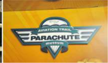
Above: Aviation Trail Visitor Center • Wright-Dunbar Interpretive Center • Dayton Aviation Heritage National Historical Park Corner of W. Third & S. Williams Sts., • 16 S. Williams St., Dayton, OH 45402 • (937) 225-7705