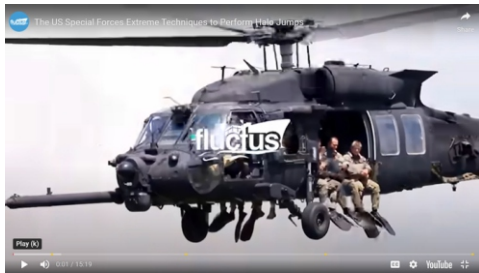
Video Presented by fluctus