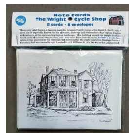
Note Cards & Envelopes