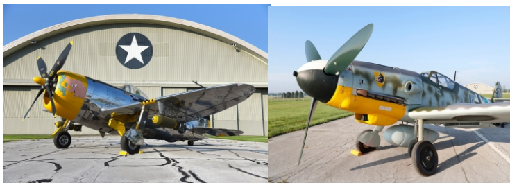
Republic P-47D (Bubble Canopy Version)

On Open Aircraft days, visitors will have the unique opportunity to look inside one of the museum's aircraft from 11 a.m. – 3 p.m. unless otherwise noted. (The list of aircraft is updated quarterly)