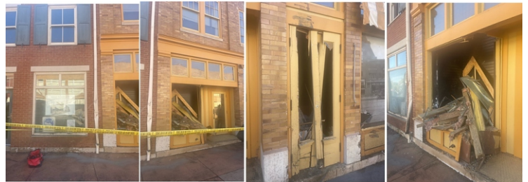
Some photos of the damage are shown above

Hoover Block Building, Setzer Building, Fish Market