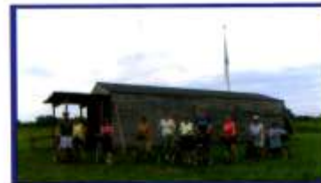
Huffman Prairie Flying Field

Follow the rules of the road on and off the bike path. Always yield to foot traffic. Wear a helmet at all times and use lights in low visibility. Take plenty of water with you and plan for changes in the weather. Look for trail signage along the way, and familiarize yourself with roads and landmarks along your route.