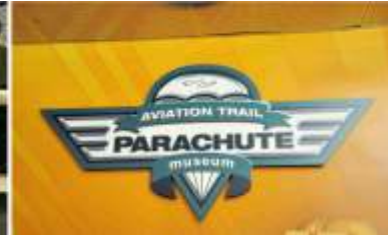
Above: Aviation Trail Visitor Center • Wright-Dunbar Interpretive Center • Dayton Aviation Heritage National Historical Park Corner of W. Third & S. Williams Sts., • 16 S. Williams St., Dayton, OH 45402 • (937) 225-7705