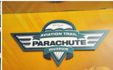
Above: Aviation Trail Visitor Center • Wright-Dunbar Interpretive Center • Dayton Aviation Heritage National Historical Park Corner of W. Third & S. Williams Sts., • 16 S. Williams St., Dayton, OH 45402 • (937) 225-7705