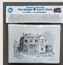
Note Cards with Art Print