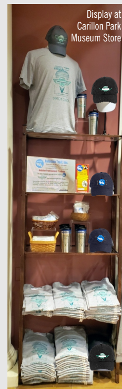
Display at Carillon Park Museum Store