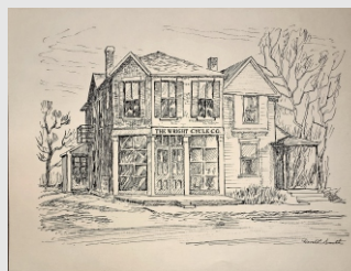
Collectable Art Prints