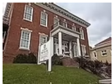
Harmon Museum Art | History | Culture

11:00am - Seating/Open Museum | 11:30am - Lunch Served | 12:00pm (noon) - Speaker