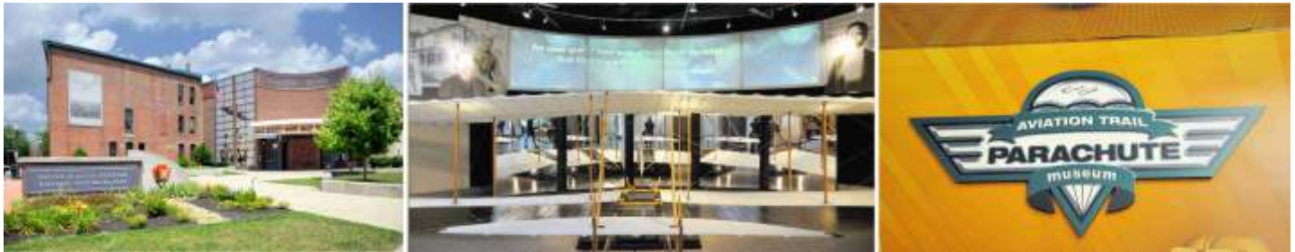
Above: Aviation Trail Visitor Center • Wright-Dunbar Interpretive Center • Dayton Aviation Heritage National Historical Park Corner of W. Third & S. Williams Sts., • 16 S. Williams St., Dayton, OH 45402 • (937) 225-7705

This "Flight Log" highlights some of the stories and recent events featured on the Aviation Trail website: AviationTrailInc.org