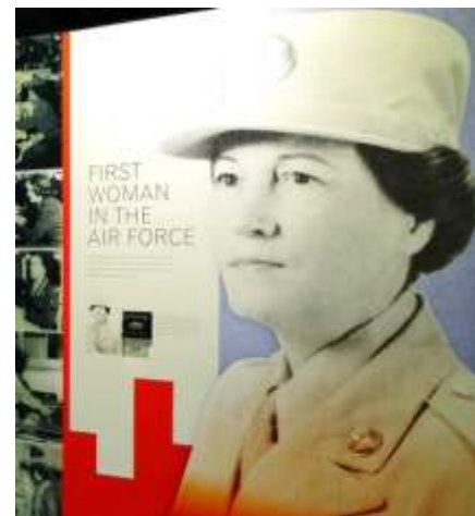
Pictured above: Staff Sergeant Esther M. Blake, first woman in the Air Force, display in Korean War Gallery

This multi-part exhibit has displays in each of the museum's building. It starts with early female aviators and grows through the last seven decades as female pioneers pushed through the barriers to become effective leaders on all Air Force subjects. It explores topics regarding women in flight, the struggle for equality, inclusion in a post-combat exclusion policy Air Force, and scientific developments produced by women working in research and development.