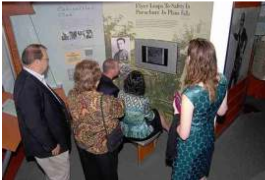
Photos: • above - visitors at the Parachute Museum display • at left - the Caterpillar Club pin in display case